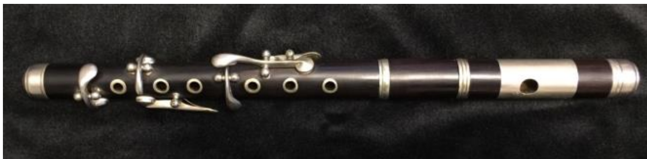
Figure 3. Anonymous English six-key, E-flat military piccolo, circa 1890.