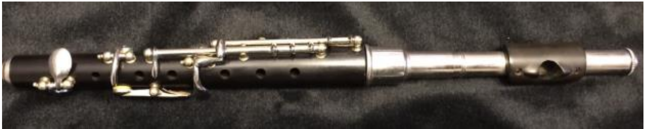
Figure 4. Anonymous German reform piccolo in the style of Schwedler, circa 1890.

Many makers would experiment and alter Boehm's original design but not without creating problems. Maximillian Schwedler was a champion of the German reform-system flutes and designed a mechanism that kept the conical bore and cylindrical head joint, a combination that he felt was superior in tonal colors. His mechanism (see figure 5) varied greatly from the Böehm-system and required fingering akin to those of earlier flutes.