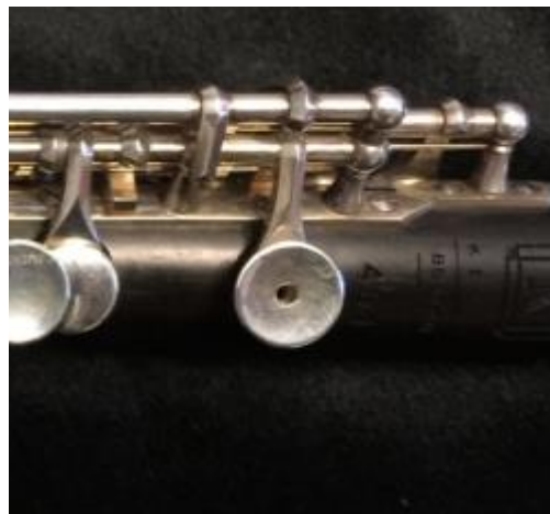
Figure 12 Keefe vented C key.