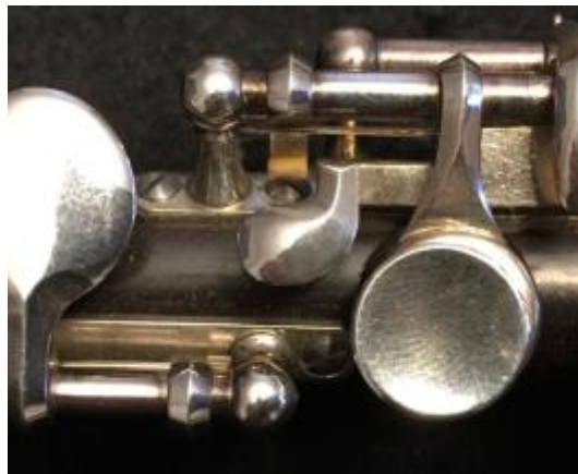
Figure 11. Keefe Brossa F sharp.

head joint styles as well as custom head joints. In addition, 14k gold options are available for the rings and sleeves on their head joints. Several innovative key work options are available including, Brossa F-sharp (see figure 11), the vented C key (see figure 12), split E mechanism, a G-sharp trill key, and a C-sharp trill key (see figure 13). The C-sharp trill key functions just as it does on the flute. The mechanism includes an additional tone hole and key between the trill and thumb B-flat tone holes as well as an additional lever near the chromatic B-flat lever. This mechanism has only recently become available likely due to the compact size of the piccolo and the inherent design problems that arise with additional key work in such a compact space.