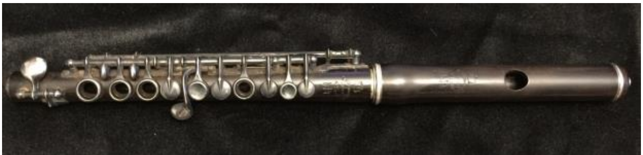
Figure 6. Thibouville Cabart ring-system piccolo, circa 1878.

The resurgence of orchestration including piccolo could be due in large part to the introduction and more widespread availability of the Böehm-system piccolo. Early Böehm-system piccolos used ring-keys keeping the open tone holes associated with the simple-system piccolos while also taking advantage of the newer mechanism (see figure 7).