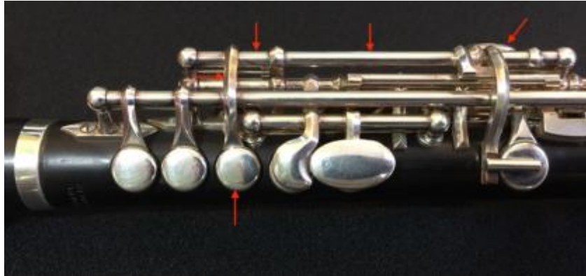
Figure 13. Keefe C sharp trill.

The G-sharp trill key facilitates the trill from G7 to A7, normally an awkward or impossible trill on most piccolos. The mechanism for this trill (see figure 14) includes the addition of a touch piece for the right hand that couples with the C-sharp trill key and allows the player to simultaneously vent the G-sharp and C-sharp trill tone holes with only one finger. 94