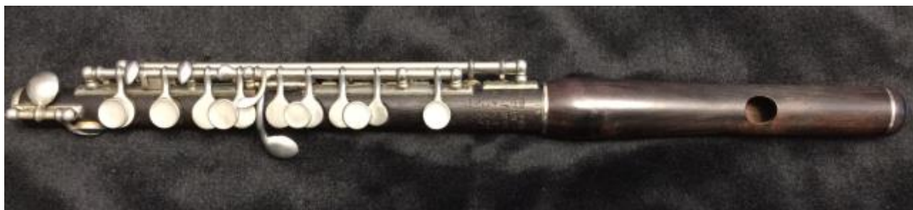
Figure 8. Boehm-system by Emil Rittershausen, Carl Fischer stencil piccolo, circa 1927.

The piccolo varied greatly in both design and materials during the early 1900s. The William S. Haynes Company reported that 95 percent of piccolos sold in 1930 were silver with a cylindrical bore. Silver was scarce during World War II and metal for military instruments was purchased from private sources. Both Haynes and Verne Q. Powell Flute, Inc. discontinued the production of wood piccolos for a limited time after World War II. 82 In 1950, both companies discontinued the production of cylindrical bore piccolos completely, continuing to make only conical bore wood and silver piccolos (see figure 10). During the same period, George Bundy