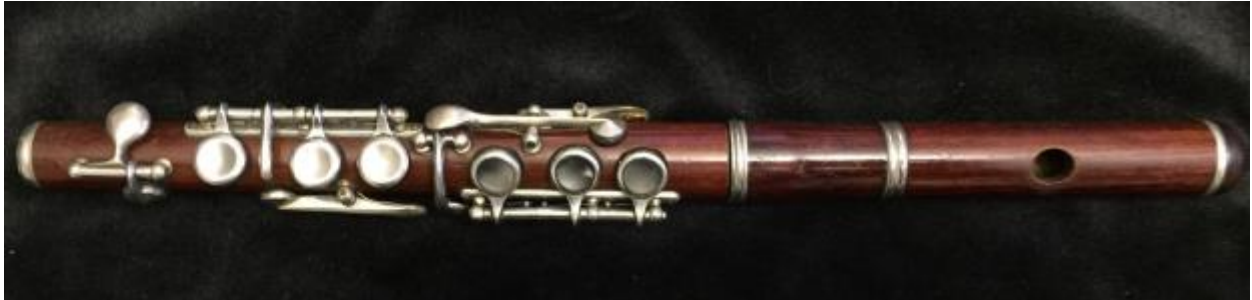
Figure 5. Anonymous English piccolo, circa 1870.

could be attributed to the inherent mechanical deficiencies of the simple-system piccolos which limited their ability to play in more remote key signatures called for as chromaticism grew. The Böehm mechanism was not immediately popular, and makers experimented with key work designs that attempted to keep the simple-system fingers while enlarging the tone holes for pitch and tone (see figure 6).