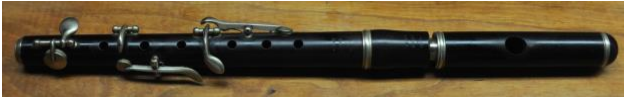
Figure 7. Jean-Louis Tulou, Paris. six-key D-flat Piccolo, Pitch A=435.

The piccolo received the greatest mechanical advancement at the beginning of the twentieth-century. Performers and composers were aware of the inconsistency of instruments in use and growing demand encouraged makers to focus on applying the Böehm-system. Instruments made of gold, silver, German silver, and many types of composite materials appeared in the market due to the growth in experimentation. The early twentieth century also saw a rise in the retail market and distribution of professional instruments. Large music retailers began marketing instruments under their company name although the instruments were made by well-known and respected makers not the retailer. Carl Fischer Music was one such retailer in New York and an importer of professional instruments. The company imported instruments from notable French and German makers and added the Carl Fischer logo, referred to as a stencil, before selling the instrument. Respected flute and piccolo maker, Emil Rittershausen (1852-1927), was a German maker who was trained by Böehm in the shops of Böehm & Mendler. 81 Rittershausen exported to Carl Fischer who added the Fischer stencil (see figure 9).