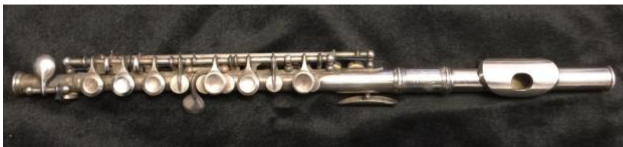
Figure 9. Carl Fischer silver conical D-flat piccolo, circa 1925.

The piccolo varied greatly in both design and materials during the early 1900s. The William S. Haynes Company reported that 95 percent of piccolos sold in 1930 were silver with a cylindrical bore. Silver was scarce during World War II and metal for military instruments was purchased from private sources. Both Haynes and Verne Q. Powell Flute, Inc. discontinued the production of wood piccolos for a limited time after World War II. 82 In 1950, both companies discontinued the production of cylindrical bore piccolos completely, continuing to make only conical bore wood and silver piccolos (see figure 10). During the same period, George Bundy