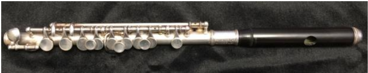
Figure 10. Conn Pan American model with ebonite head and silver body, circa 1925.

Some companies offer synthetic materials that emulate the tonal qualities of wood but are not affected by moisture or temperature extremes which can cause wood to crack. Ebonite is a hard, rubberized material that looks like dark wood, is easily machined, does not warp or crack, and produces a sweet wood-like tone. Ebonite was first introduced around 1840 and was predominantly used for piccolos due to frequent use outdoors. Ebonite is the name associated with musical instrument manufacturing although the material is more generally known as vulcanized rubber. Conn Instruments made piccolos with a cylindrical metal body and an ebonite head joint combining the new material into a production model (see figure 2)