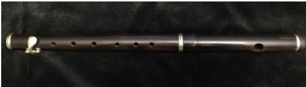
Figure 2. Anonymous one-keyed piccolo.

During the Baroque period (1600-1750), the piccolo began to separate from the fife likely due to the need for an instrument usable in concert settings. In this period, both the simple system flute and piccolo had cylindrical head joints with conical bore bodies, and a key to facilitate D-sharp (see figure 3)