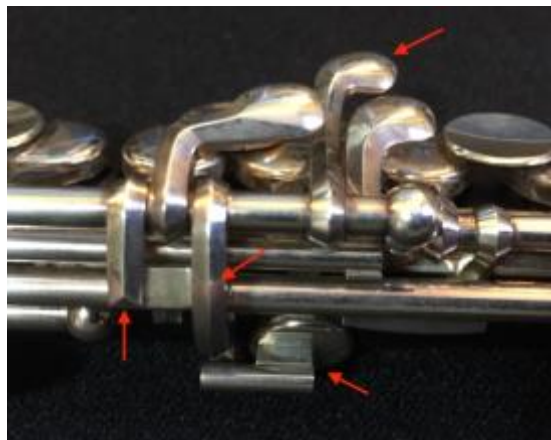
Figure 14. Keefe G# Trill Mechanism.

The G-sharp trill key facilitates the trill from G7 to A7, normally an awkward or impossible trill on most piccolos. The mechanism for this trill (see figure 14) includes the addition of a touch piece for the right hand that couples with the C-sharp trill key and allows the player to simultaneously vent the G-sharp and C-sharp trill tone holes with only one finger. 94